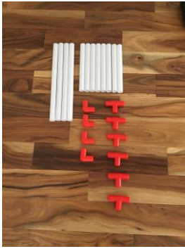
4 center bars, 8 perimeter bars, 4 L joints, 6 T joints