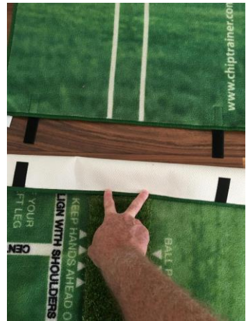
Use Velcro to attach Stance Mat to Target Mat