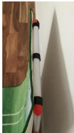
Use Velcro to attach Target Mat to top center bar